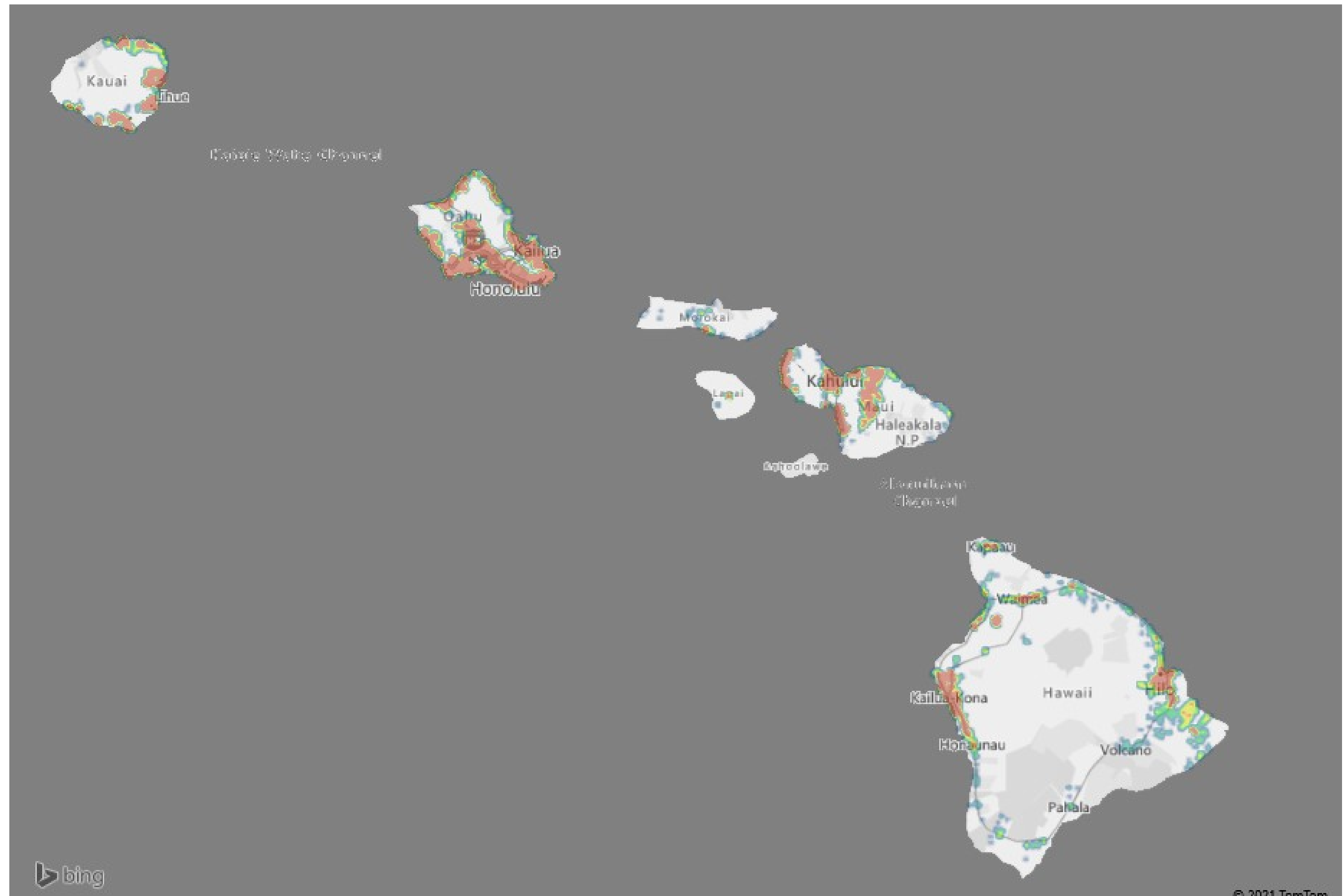
U.S. Small Business Administration (SBA) Office of Capital Access. PPP FOIA. Retrieved November 1st, 2021.

The image depicted to the right is a heat map showing the distribution of all total PPP loans in the state of analysis.