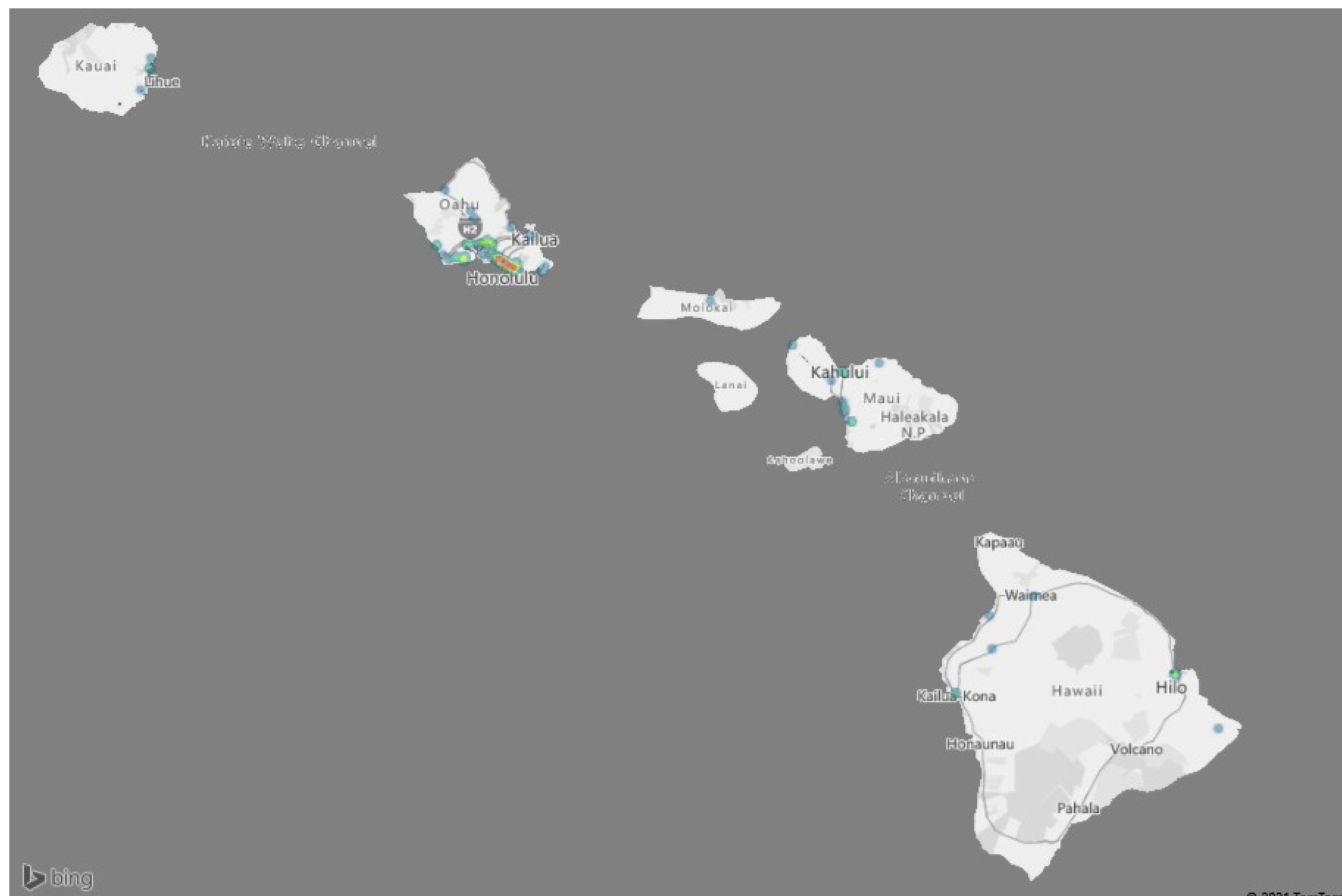
U.S. Small Business Administration (SBA) Office of Capital Access. PPP FOIA. Retrieved November 1st, 2021.